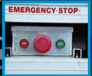
All conveyors have a single emergency safety stop.