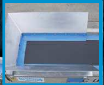
Conveyors have Hoppers with adjustable positions.