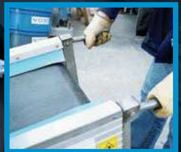
All lightweight alloy conveyors have handles for two person lifting.